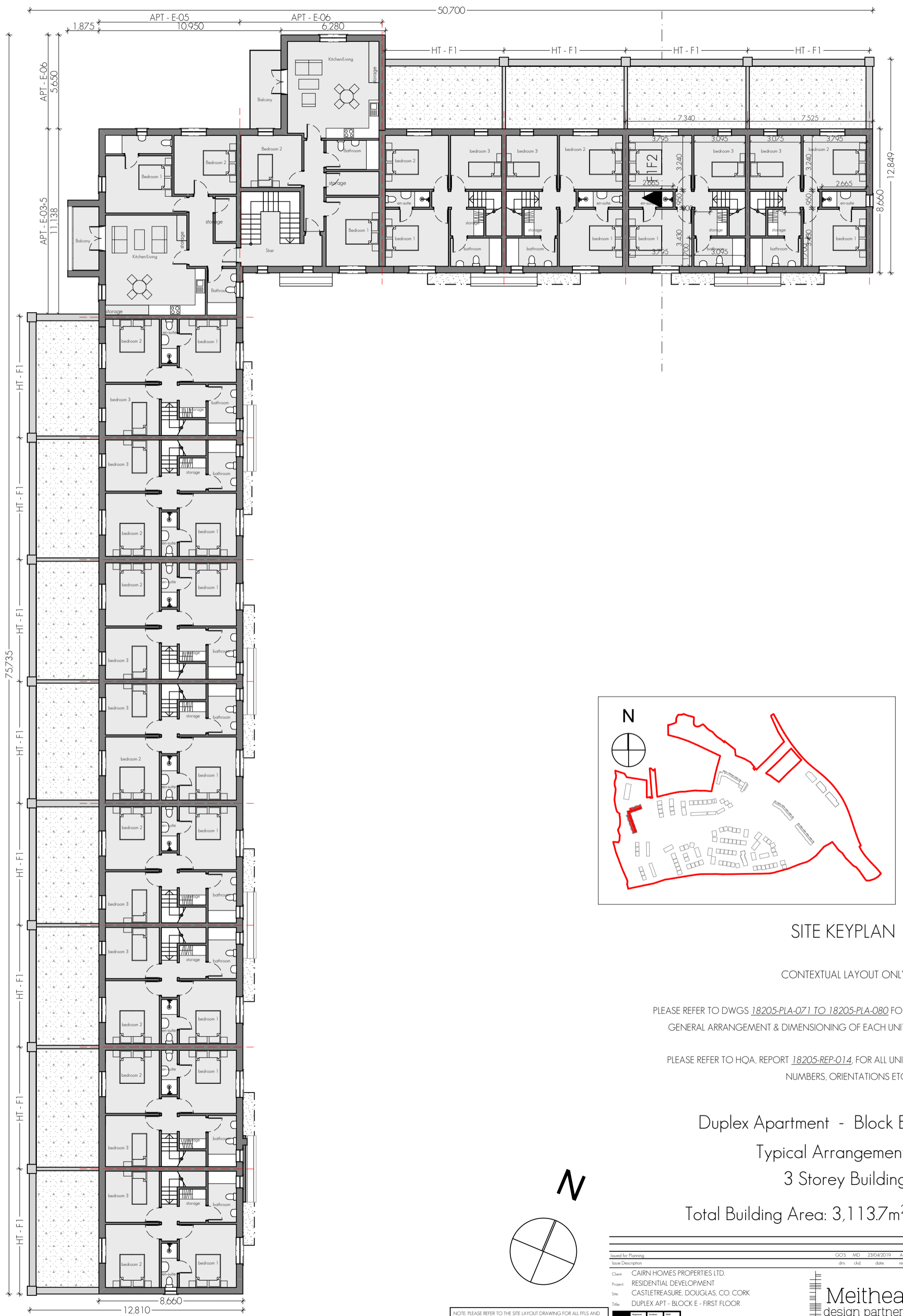
Contextual First Floor 1:200